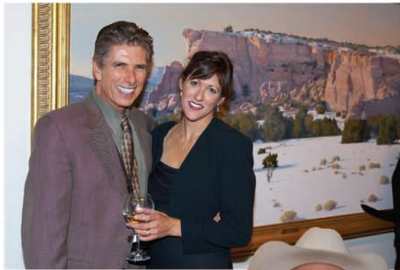
QUEST FOR THE WEST IS A GREAT OPPORTUNITY TO MEET THE ARTISTS