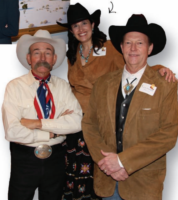
FUN AT BUCKAROO BASH