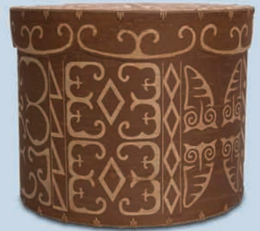
David Moses Bridges (Passamaquoddy) Birch bark Bandbox, 2009 Museum purchase with funds from Ellen M. Reed

The staff continues to make major progress in collections care and management. With the addition of Crista Pack in the grant-supported conservation technician position, it has been possible to annually clean and wax the 10 outdoor sculptures located on the museum's grounds and complete other minor object treatments. Our three-year grant from the Institute